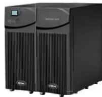
Battery Cabinets (Optional)